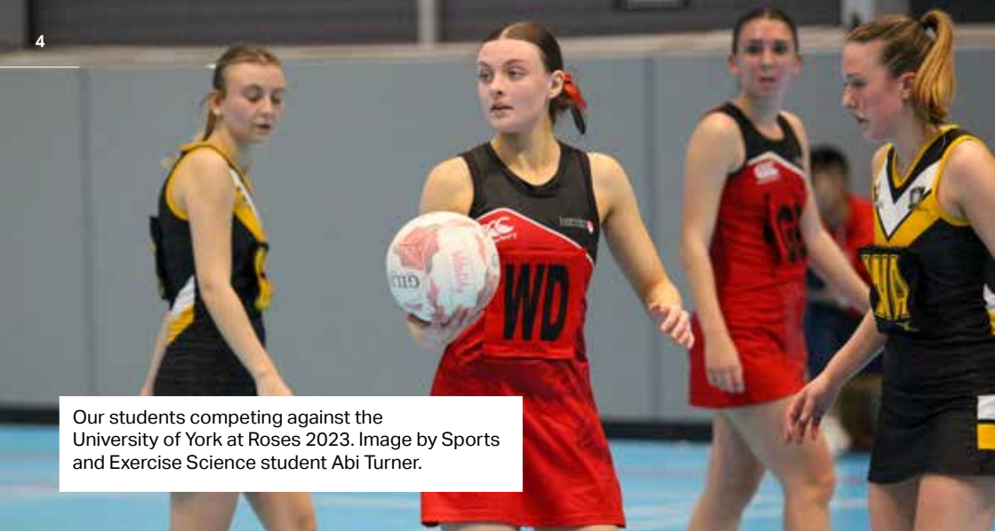
Our students competing against the University of York at Roses 2023.