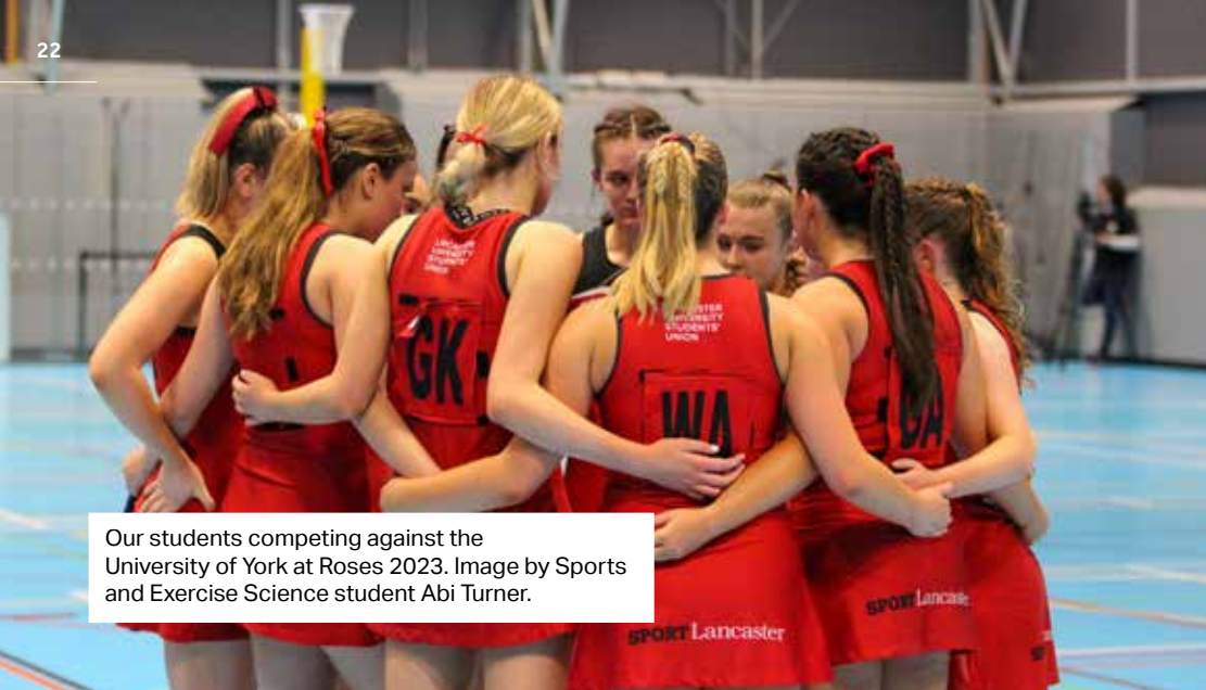
Our students competing against the University of York at Roses 2023.